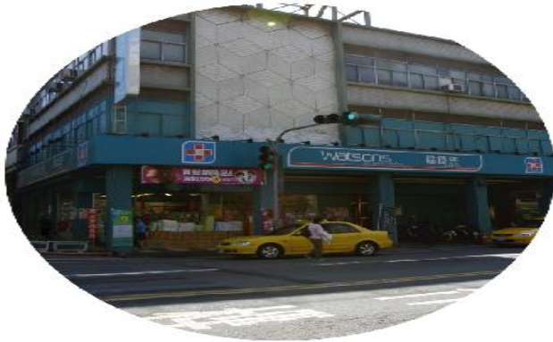
WATSONS 屈臣氏 http://www.watsons.com.tw/