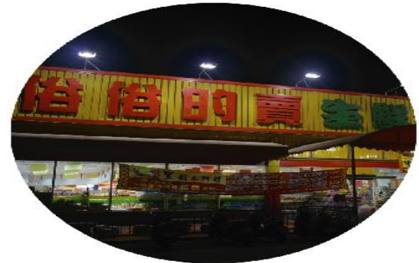
俗俗的賣 (Su-Su De Mai)