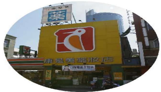
COSMED 康是美 http://www.cosmed.com.tw/