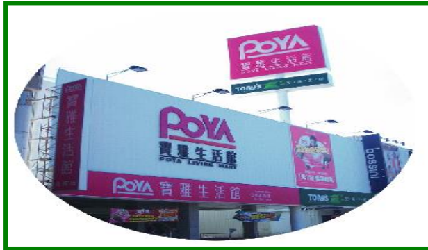
POYA 寶雅 http://www.poya.com.tw/